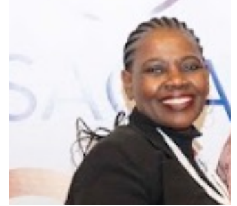
PROF TUWANI RASENGANE

At the heart of effective recognition is its meaningfulness to the SAOA membership and, importantly, to the recipient. This necessitates a move away from one-size-fits-all towards a more personalised, thoughtful acknowledgment of individual achievements. The goal is to ensure that the recognition received is not just seen as a gesture but as a genuine appreciation of the individual's contributions.