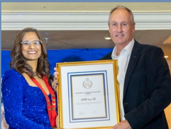
HOYA LENS SA

TO A SUPPLIER OF FRAMES, LENSES, CONTACT LENSES, OR EQUIPMENT FOR OUTSTANDING SUPPORT GIVEN TO THE SAOA OVER TIME.