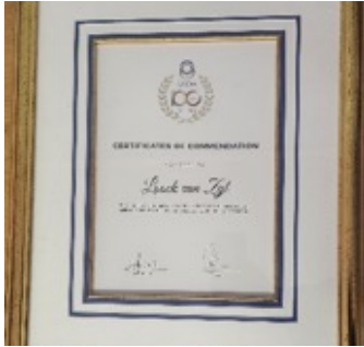
LOOCK VAN ZYL